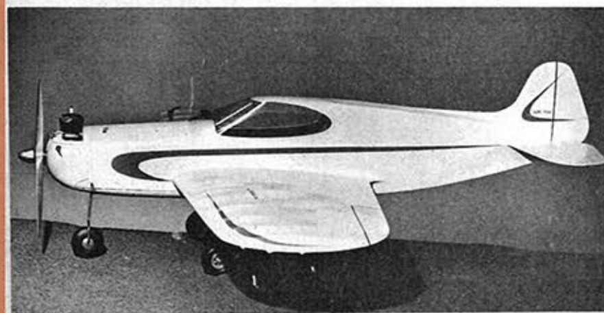
As landplane, craft looks like Goodyear racer. Does all loops, and horizontal eights.