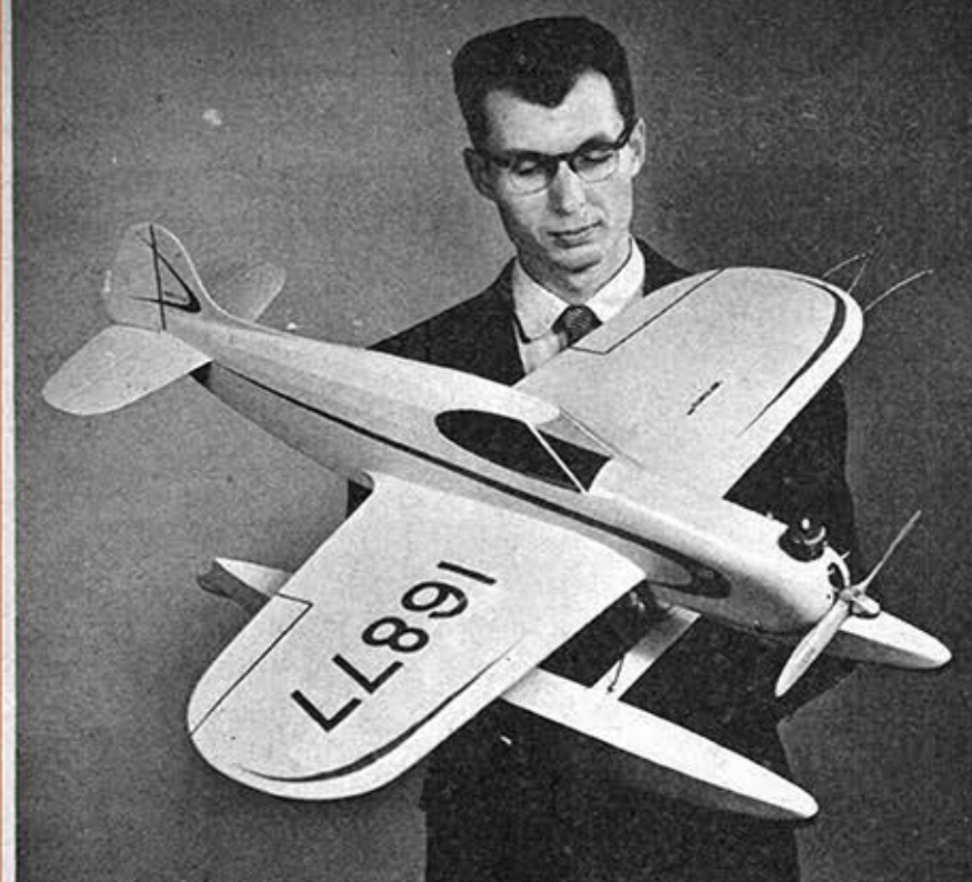
As seaplane, ship gets on step, rises like real crate. Amazing sight is inverted flight.

For land or water this is the sport plane to end all sport planes! The J. Roberts Flight Control System makes Sure Fun dream to fly.